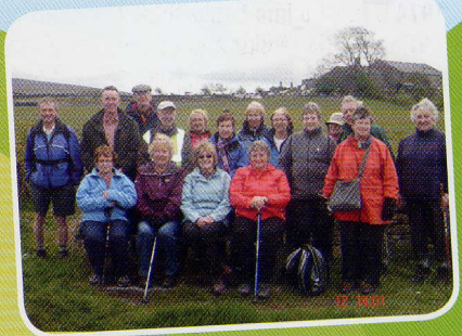
History Walk Away Day at Wycollar

Follow the canal looking back at the moor you have just come from and take the first exit at Longing Lane which becomes Rainhall Road and takes you back into Barnoldswick town centre.