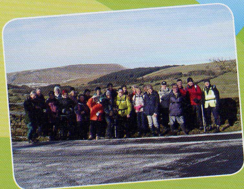
Walking group above Roughlee, Pendle in background