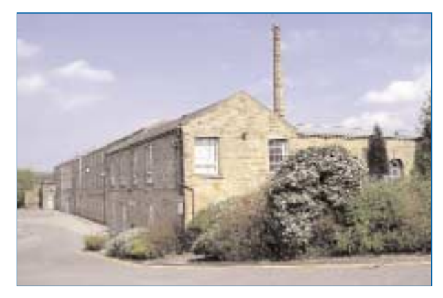
See Boards 1, 2, 3 & 4 for more information

The Trail leaves the Canal at Lomeshaye Road Canal Bridge, turns left, under the M65, into Lomeshaye Village, passes through the Industrial Estate to Lomeshaye Marsh Local Nature Reserve and follows Pendle Water to Quaker Bridge. It crosses over the Bridge, turns left under the Motorway on other bank of the river, crosses over the river by the footbridge and turns left up the hill passed Monkhey Farm and back to the start.