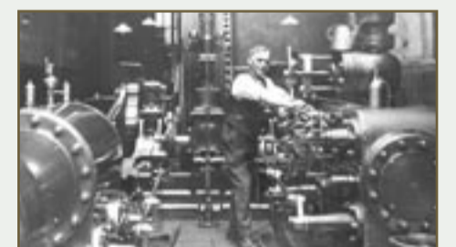
Clough Mill Engine

A very powerful engine. When fuel is burned inside the engine, hot air and gases are produced and then pushed out of the back of the engine at high speed which forces the engine forward.