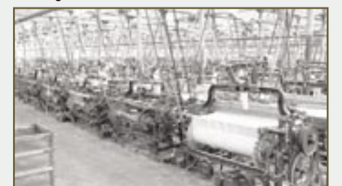
Weaving at Bancroft Mill