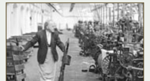
Weaving at Bancroft Mill