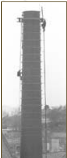
Calf Hall Chimney